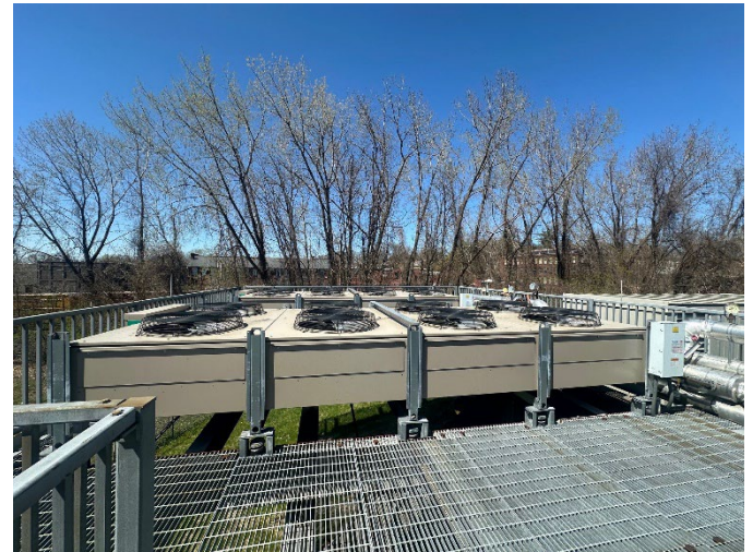
Cogent Springfield – 400 Taylor Street