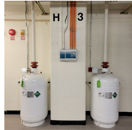
Cogent Phoenix – 1530 E Roeser Road